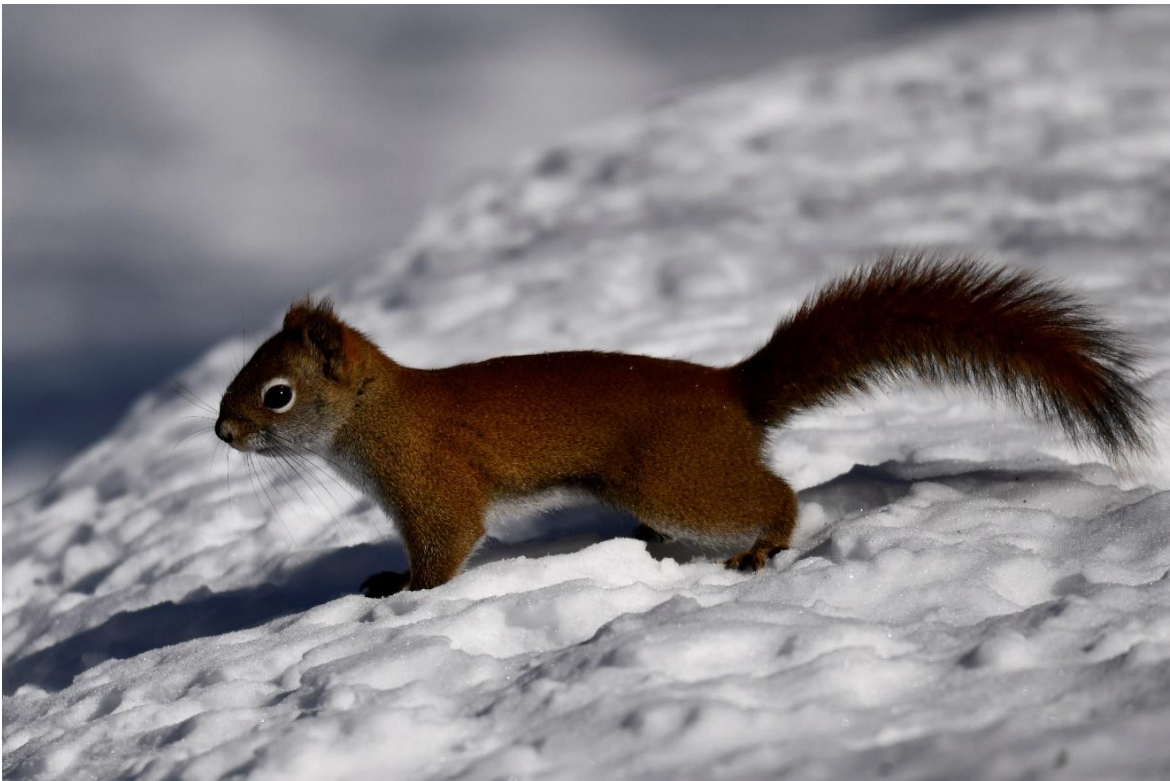
Picture: Red Squirrel