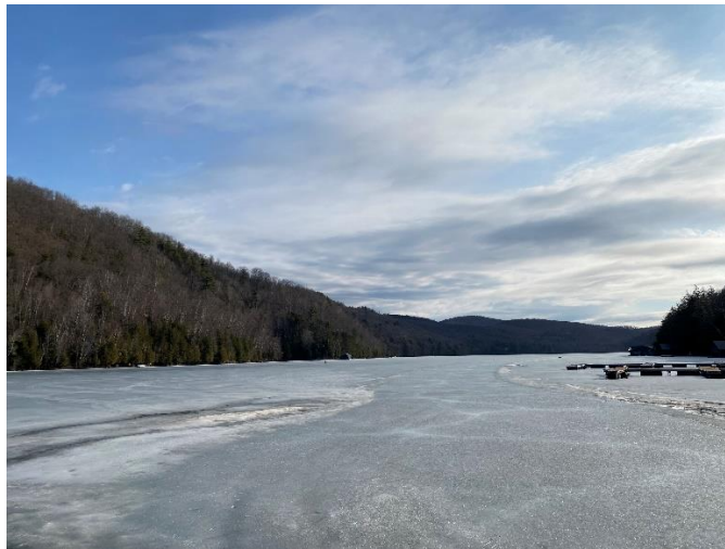
Picture taken from the landing on April 15 th

Please send us your completed form to dg@barkmere.ca .