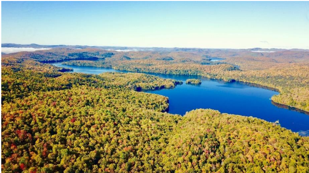
Fall 2025 at Bark Lake

For more details, please consult the minutes of the Council meeting that will be posted on the Town's website once they are ratified, generally at the next council meeting.